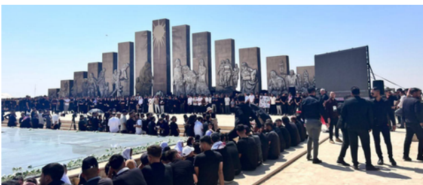
Commemoration of the Yazidi Genocide, August 2025, at the Yazidi Genocide Memorial, Solagh, Sinjar.

■ On September 8, the National Center for International Judicial Cooperation (NCIJC), with the support of IOM Iraq, and in cooperation with the Directorate, organized a workshop entitled “Ways to implement female survivor-centered practices as models for accountability for international crimes committed by the terrorist entity ISIS against the Yazidi community and other minorities in Iraq.” The workshop emphasized the importance of including the voices of victims in the justice and accountability process. Read more about the event here: www.sjc.iq/view.77410/