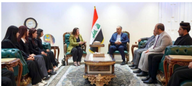
Baghdad: Meeting between the Ministry of Education and the General Directorate for Survivors' Affairs to agree on new measures supporting survivors' return to school.

More details of these meetings can be found on the Directorate's Facebook page: bit.ly/3IBXWgS