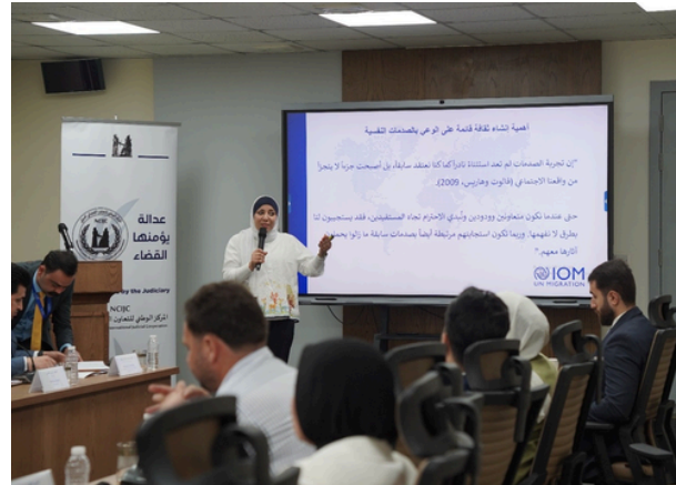
Baghdad: International workshop organised by the National Center for International Judicial Cooperation in cooperation with the General Directorate of Survivors’ Affairs, Monday, September 8, 2025.

■ Jiyon Foundation for Human Rights, in cooperation with the Iraqi High Commission for Human Rights and supported by the German Federal Foreign Office, hosted a panel exchange in Baghdad titled, “Strengthening Iraq’s Legal Framework to Support Children Associated with Armed Conflict: Realising the Right to Rehabilitation for Male Survivors of ISIL Crimes.” The panel discussion highlighted the importance of the holistic rehabilitation of male survivors, including psychosocial support, education, economic empowerment, and full implementation of all reparative measures guaranteed under the YSL. Read more here: tinyurl.com/4d88w3jp