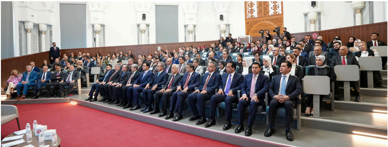
The National Center for International Judicial Cooperation commemorates the Yazidi Genocide, August 2025, Baghdad.