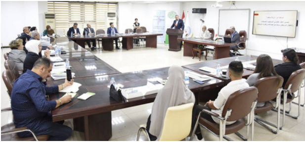
Panel Discussion by Jiyon Foundation for Human Rights, September 2025, Baghdad.

■ Jiyon Foundation for Human Rights, in cooperation with the Iraqi High Commission for Human Rights and supported by the German Federal Foreign Office, hosted a panel exchange in Baghdad titled, “Strengthening Iraq’s Legal Framework to Support Children Associated with Armed Conflict: Realising the Right to Rehabilitation for Male Survivors of ISIL Crimes.” The panel discussion highlighted the importance of the holistic rehabilitation of male survivors, including psychosocial support, education, economic empowerment, and full implementation of all reparative measures guaranteed under the YSL. Read more here: tinyurl.com/4d88w3jp