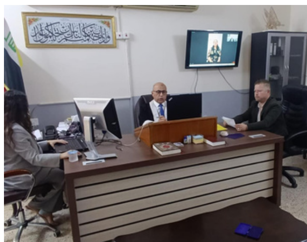
The Directorate of Survivors' Affairs and Alqosh Investigation Court record Yazidi survivors' testimonies remotely in cooperation with the Iraqi Consulate in Frankfurt.