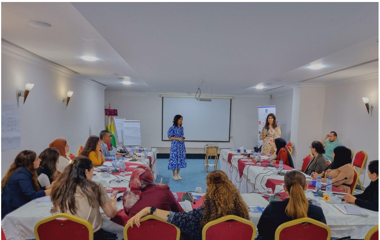
Representatives of C4JR's member organizations engage in a Training of Trainers on Ethical Engagement with Survivors of Sexual Violence in Duhok.