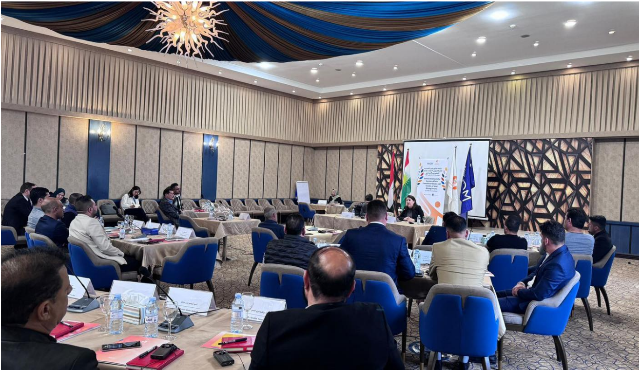
The General Directorate for Survivors' Affairs and IOM hosted a consultation with families of victims and missing persons to address various issues.

comprising family members of victims was tasked with continuing engagement with the Directorate regarding the outcomes of the meeting.