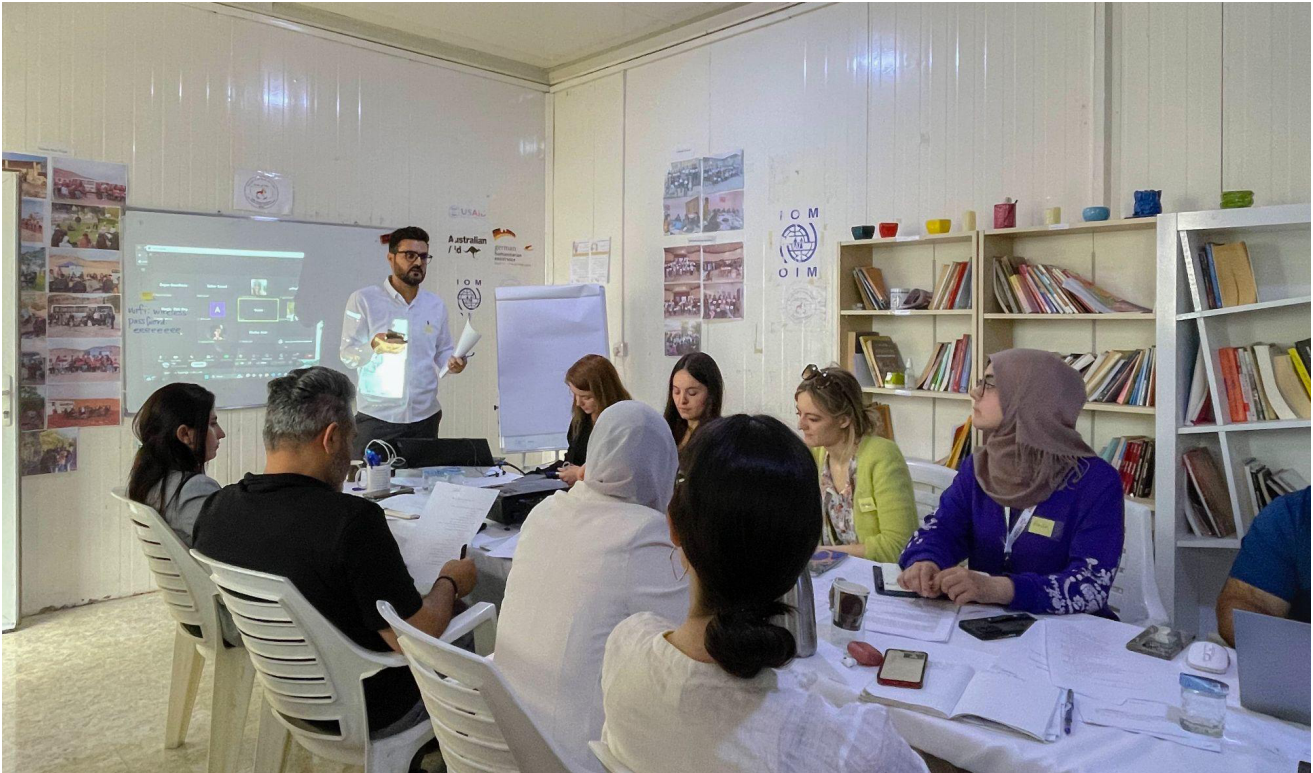
C4JR's Advocacy Working Group met in DAK organization's Shariya office for campaign planning on C4JR's 10 Demands, 10 Years After ISIL Genocide.